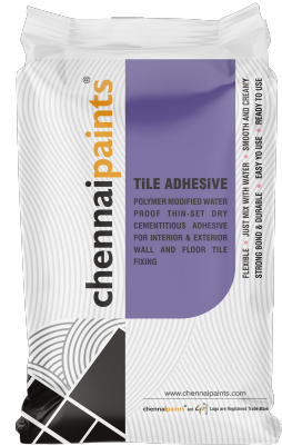
Pack Size 20Kg

Chennai paints - (Grey +) Tile adhesive is a high polymer, modified cement-based adhesive which is smooth & creamy, sanded bagged cementations powder with a high performance dry Thin set adhesive for use with water for installing Small to Medium format ceramic wall & floor tiles, vitrified tiles, precast terrazzo and natural stones in Interior and Exterior floor area . It can be used up to a maximum of 12mm bed thickness over concrete and a variety of cement-based substrates